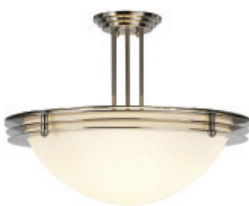
Pendant Lights 28" - 72"