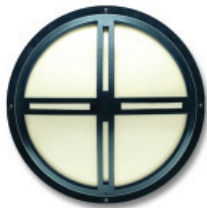
Ceiling Fixtures 15" - 36"