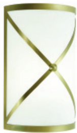
Wall Brackets 12" - 36"

One LED light engine fits Foresight luminaires of different shapes and sizes, including wall brackets, ceiling fixtures and pendants