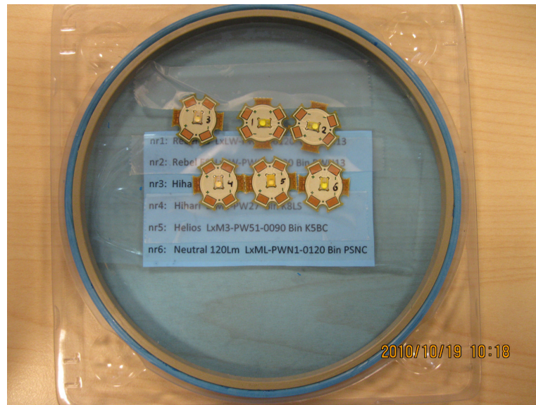
“LXML-PWN2” (Bin: TSMB) (1# sample marked on the photo)